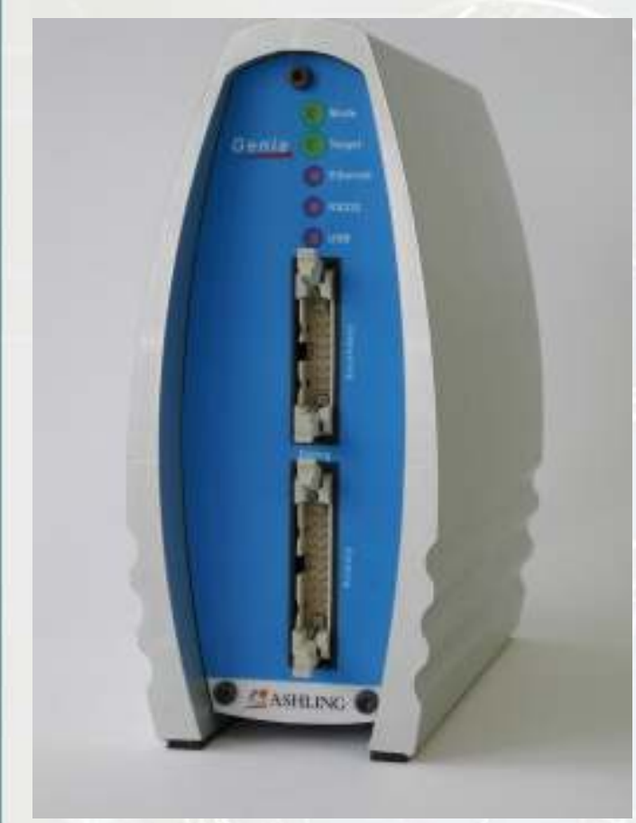
The Ashling Genia Emulator.

Ashling's Genia-PPC Emulator is a powerful networked Emulator for embedded development with Freescale's PowerPC RISC cores, using the NEXUS 5001<sup>™</sup> on-chip debug interface.